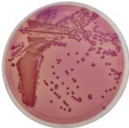
Violet Red Bile Agar